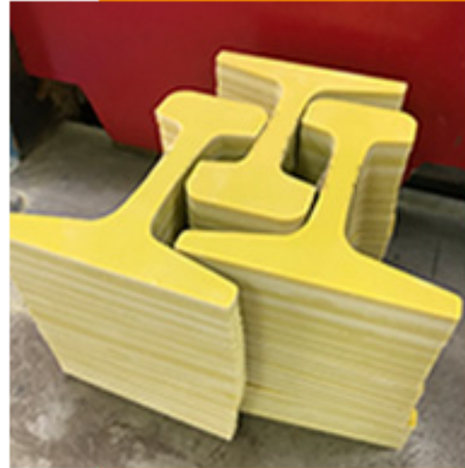
Series of insulating board processing products